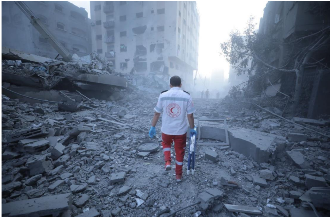
A PRCS EMT making his way through the rubble to provide the emergency medical services to the affected population from the continues bombardment.

Note: While PRCS keeps close coordination with the various partners and stakeholders; it is worth noting that PRCS Emergency Appeal is an independent appeal, that is not part of any regional or inter-agency appeal.