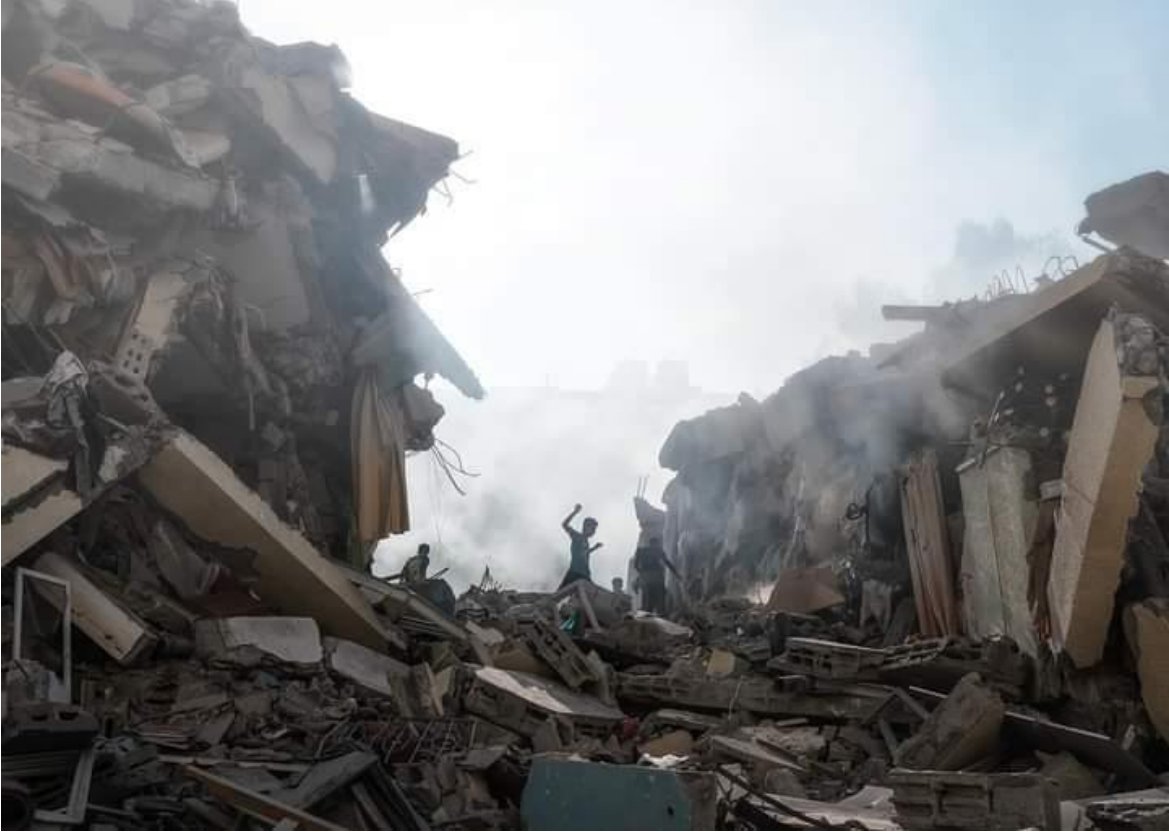
The scene of devastation caused by the Israeli airstrikes targeting on Gaza Strip.